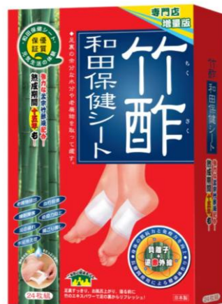
Figure 1. Bamboo Vinegar and Tian Health Patch (24 pieces): Dehumidifying foot patch, quick dehumidification, made of the highest quality Japanese moss bamboo, suitable for swollen feet and face; Vita Green.