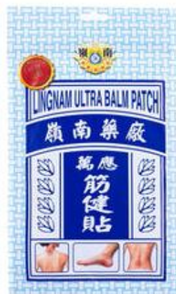
Figure 4. Hong Kong Lingnan Wanyingjinjian Patches [Scientific Research Honorary Product] 6 pieces/pack.

The patterns that emerge, though, can be different when considering domestic markets and international markets. In terms of packaging to be used within domestic markets, warm colors predominate with red and gold. Tones of orange and red evoke the culturally accepted connotation of vitality, luck, and health, and gold represents wealth and high worth. The packaging of Lingnan Wanyingjinjiantie products use minimal color with only white and blue (Figure 4). On the other hand, Yunnan Baiyao products (Figure 3) use a combination of off-white and blue, symbolizing immortality and advancement in Chinese culture. These color combinations resonate in a powerful way among Chinese consumers in that they would enhance trust regarding the efficacy and premium quality of the product. These international market-designed packaging use more cool tones, green and blue to project a sense of nature, security, and progressiveness, catering to global needs where naturalness and serenity are more accepted. The thoughtfulness behind colour use is going to make all the difference with the emotional engagement of the consumer with the pack, enabling effective communication of brands in their messages targeting specific consumer categories.