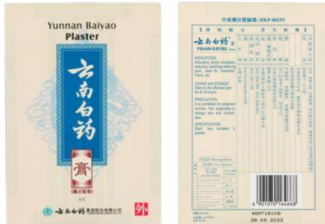
Figure 3. Yunnan Baiyao-Plaster (5 pieces).